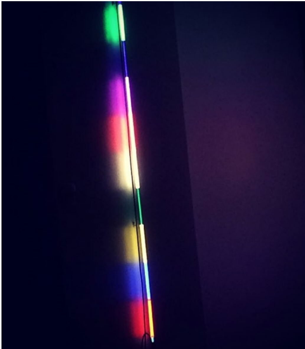
Kleber Matheus, Gamme des Couleurs , 2009