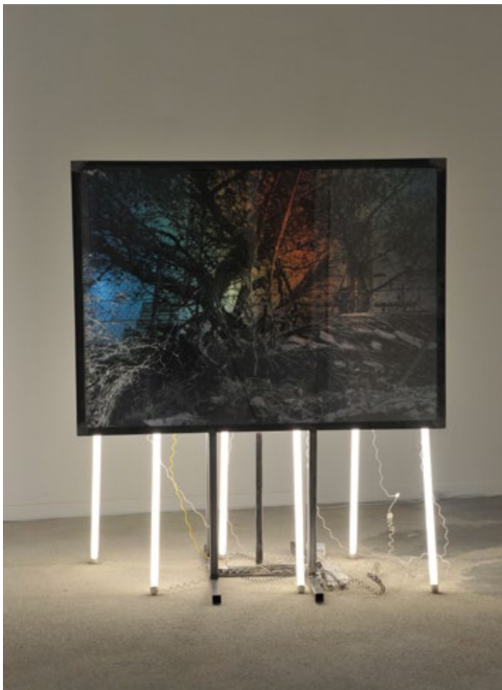
Sylvain Couzinet-Jacques, « Sans-titre », (Post-), 2015 Exhibition view