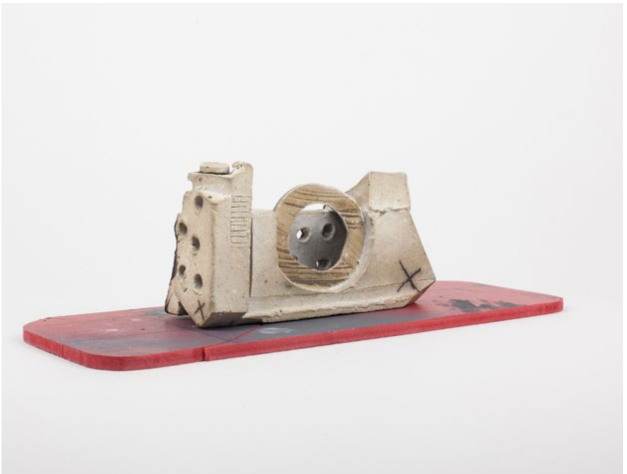
JJ Peet, CLOWNEWS_VIEWER , 2015