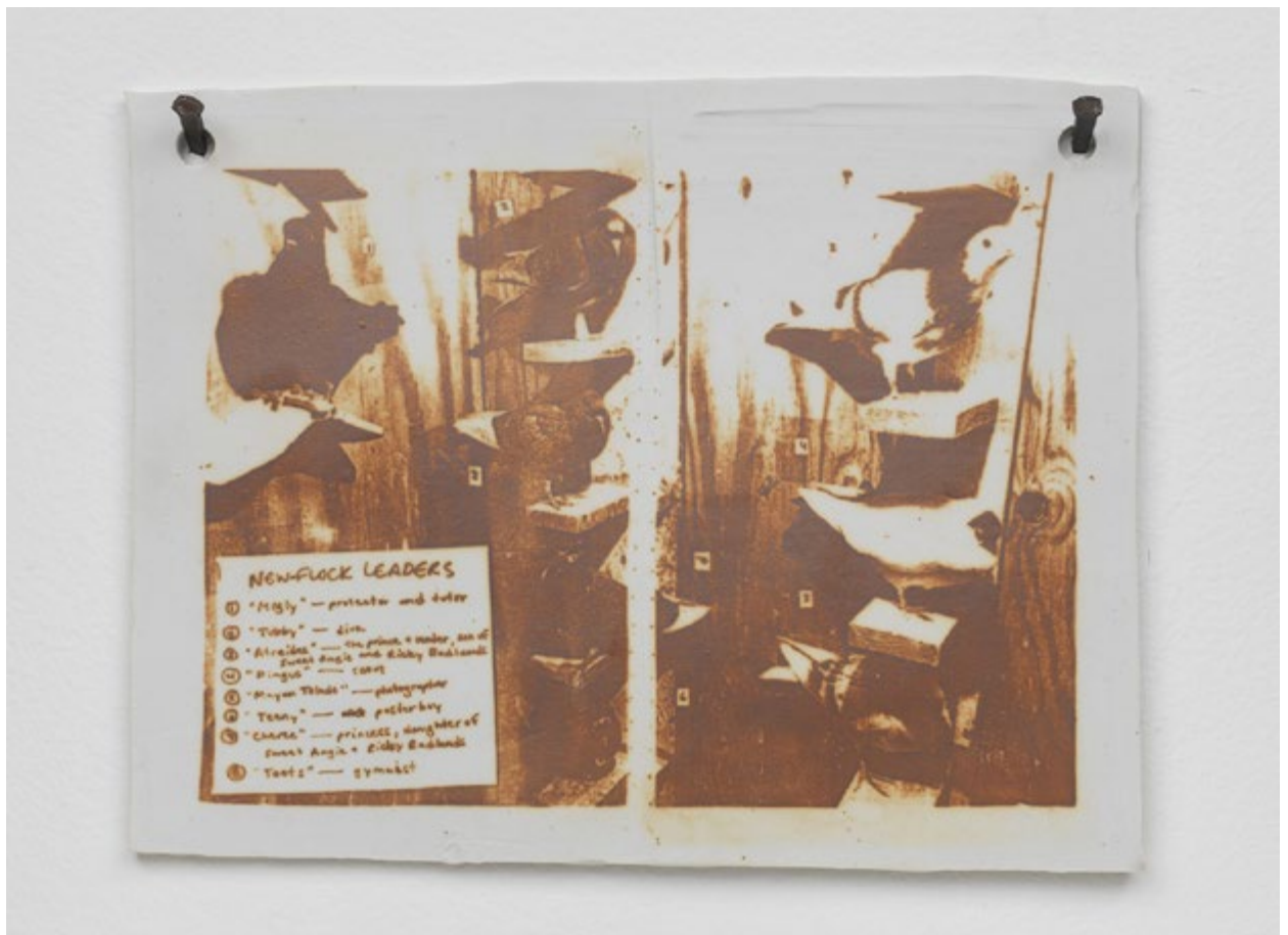
Pat McCarthy, New flock leaders , 2015

Conversation with Pat McCarthy : http://lenouvelespritduvandalisme.com/2014/08/30/a-kid-from-walden-conversation-with-pat-mccarthy-by-laura-morsch-kihn/